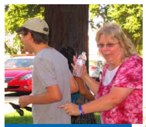
Yuba Picnic Water Fight Fun!

The best way to stop the spread of the epidemic is to spread the awareness!